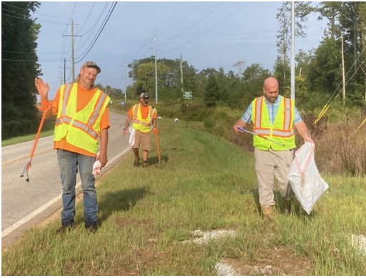
Mid-week pick up