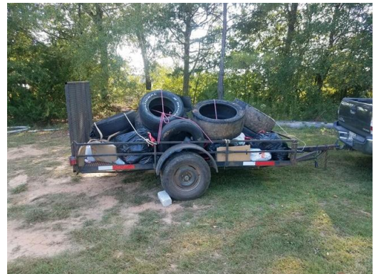
Broad River/River's Alive Event