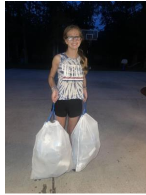
One of our Facebook supporters!!!