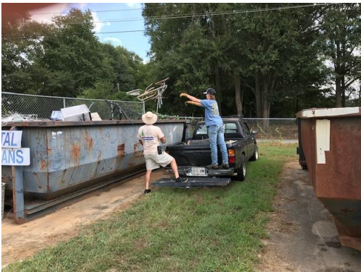
Bowman Recycling Event