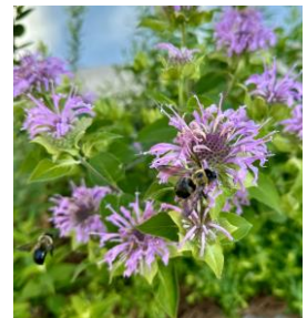
Bees at our garden