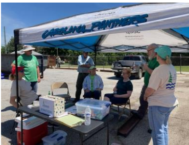
Scenes from our Recycle Event

July 17- Third Wednesday, mid-month clean up-IF it is not as hot as it was this morning at 9 AM. My car registered 85 for the outside temperature. We will send an email by the Friday before July 17 to let you know what is happening.