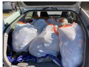
Trash from Bennett