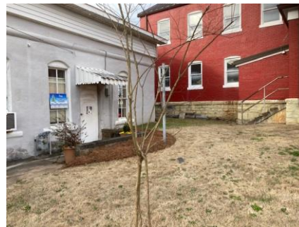
Beautifying the space outside the KECB office