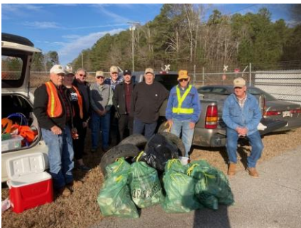
Members of Lion's Club