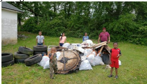
Some members of Youth Lives Matter and the huge pile of litter!