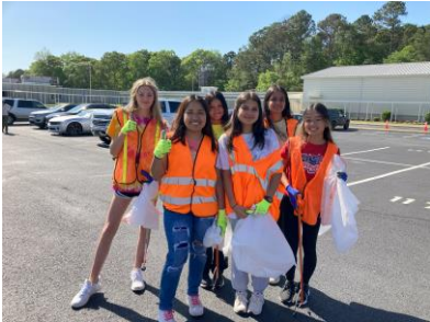
Some of the Beta Club members