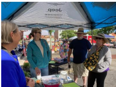
Our booth at the Spring Fling