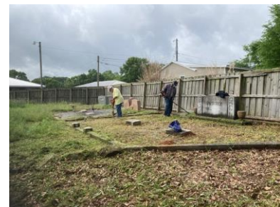
A couple of the Pinetown volunteers