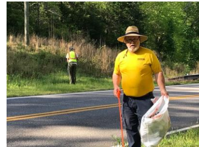
Picking up on Brewers Mill Rd.