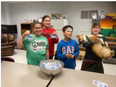
Members of the 4H ELEVATE club who assembled our "seed bombs"