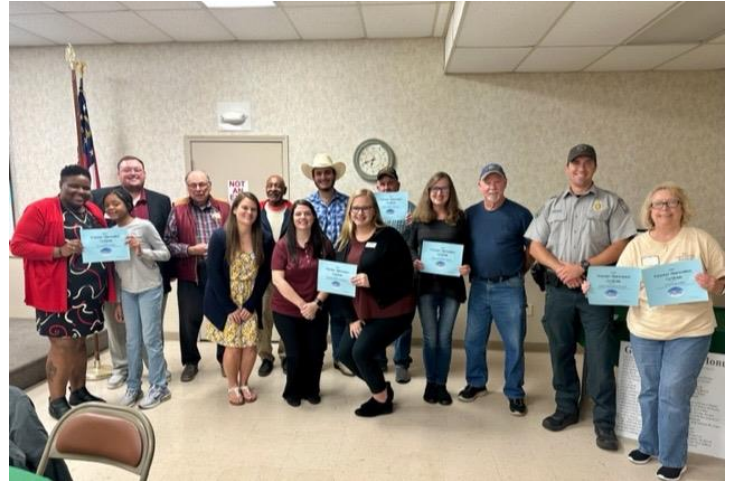
Individuals and Groups recognized by KECB