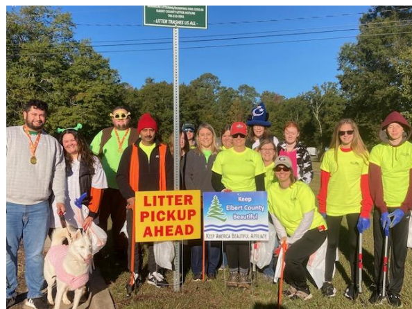
Pinnacle Bank got the Halloween vibe