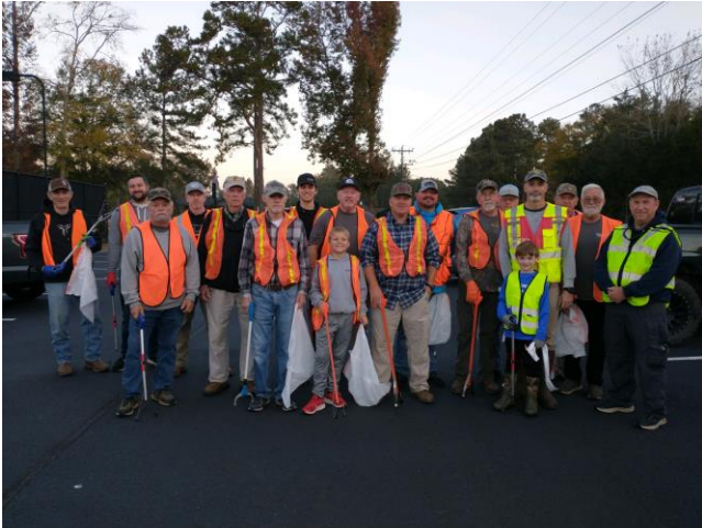
The Ground Breakers got serious! Over 900 lbs.