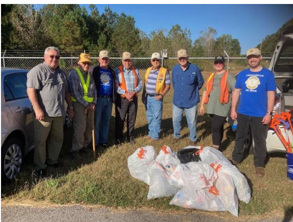
Lions Club pickup-their 5 th this year!