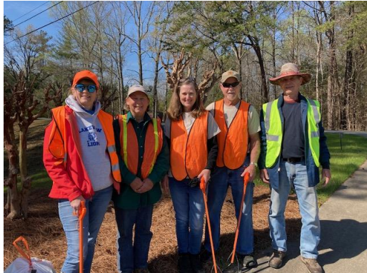
Brewer's Bridge Crew