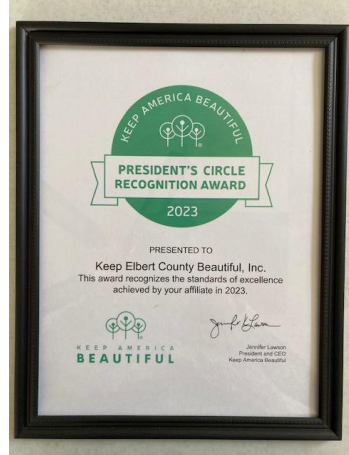
KECB Awards for work done in 2023