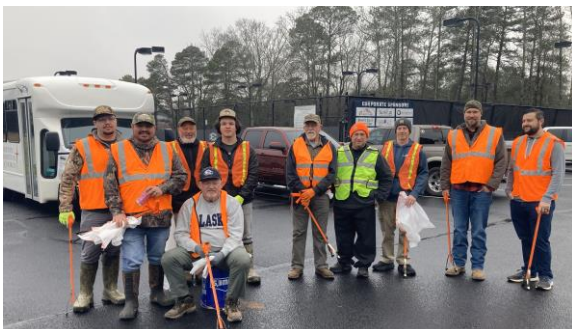
Elberton Christian Men's Group

April 20- Pinnacle Bank clean-up of Heard Dr.