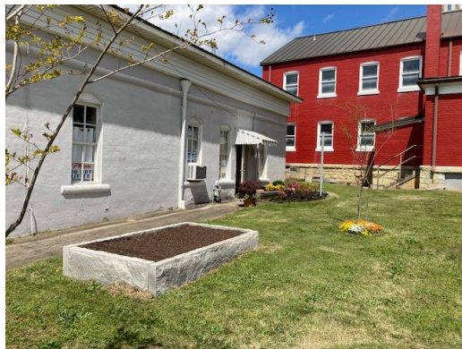
New pollinator raised bed at office